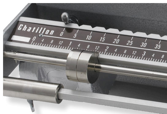
Notched Reading Beam