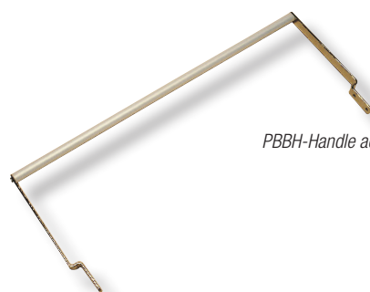
PBBH-Handle accessory (optional)