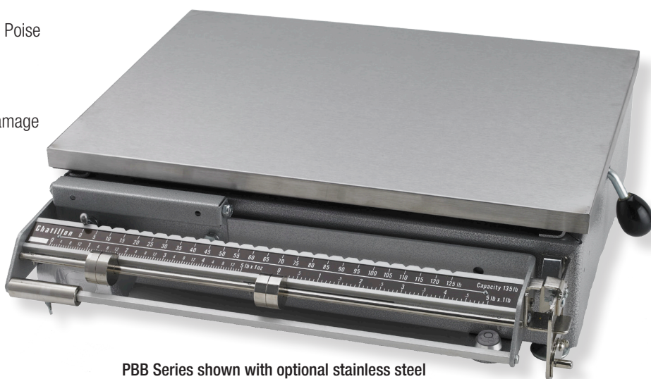
PBB Series shown with optional stainless steel cover (16076)