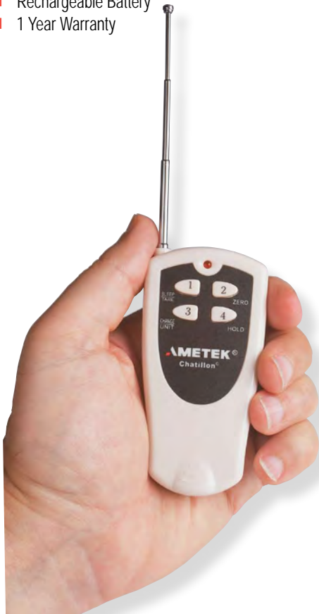
Shown with standard Remote Controller. Perform scale functions up to 30m (100 ft) away. Cannot be used with the CDR-66 or CDR-66-N.