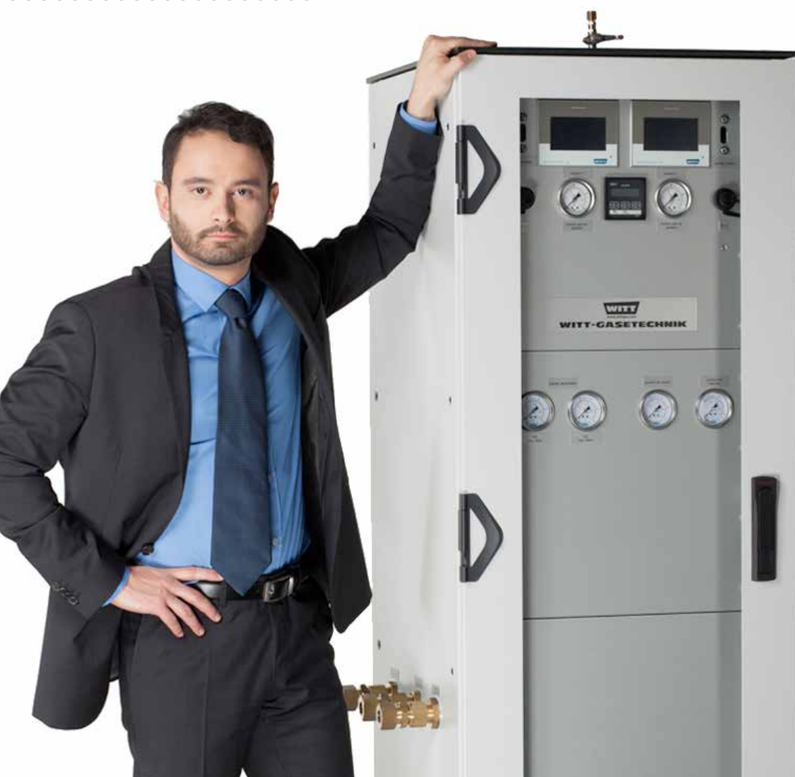
MED-MG for generating synthetic air used in medical applications